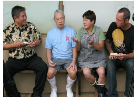
Wahiawā Town's 100 year Honda Tofu 'ohana...