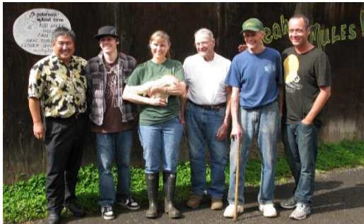
Wahiawā Town's Peterson Egg Farm 'ohana...