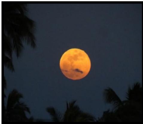
June 5 th , 2020 "Strawberry Full Moon"

06.05.2020 ... A "Strawberry Full Moon" as well as a Total Lunar Eclipse took place on this day. Today, Friday, we entered the 2020 Triple Eclipse Portal starting with the June 5 th Penumbra Lunar Eclipse . — when the moon is only in the Earth's less opaque outer shadow. Today's Eclipse was not visible from Hawai'i but witnessed in Africa, Asia and a few other countries on the other side of our world.